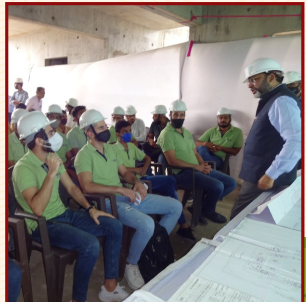
On-site Training Session for Technograhis in Rajkot, Gujarat