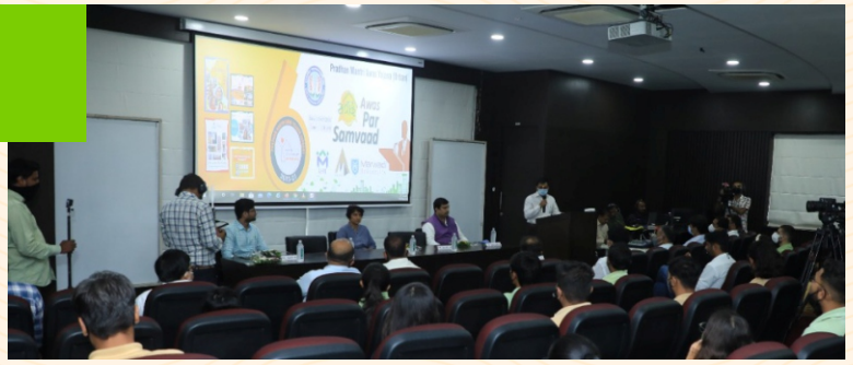
Awas Par Samvaad seminar in Rajkot, Gujarat

'Awas Par Samvaad' aims to create awareness and propel 'Housing for All' as a universal theme amongst multiple stakeholders belonging to varied streams of learning and practices. This will be done through 75 workshops and seminars by educational