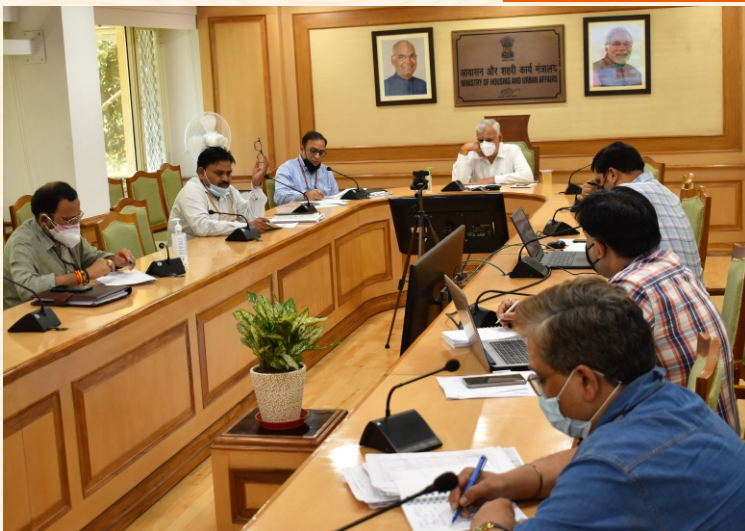
Secretary, MoHUA, & other officials attend 5th meeting of Project Monitoring Committee