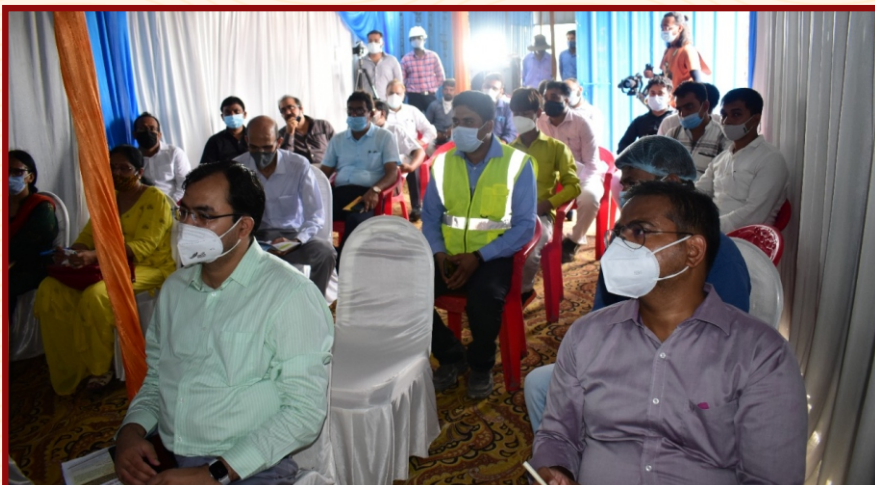
On-site Training Session for Technograhis in Lucknow, Uttar Pradesh

An on-site training session was organized for Technograhis comprising of 35 civil engineering students, faculty members at LHP site in Rajkot. They learnt about the use of French technology 'Monolithic Concrete Construction using Tunnel Formwork' and how it would help in the construction process at faster pace. Construction of 1,144 houses are underway in the city using this technology. Similarly, in Lucknow, an on-site training programme for Technograhis was organised at LHP site. Over 30 students, engineers and other stakeholders were briefed about innovative construction technologies and their nitty-gritties.