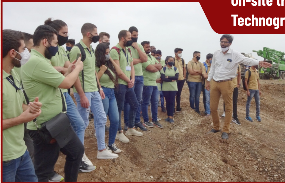
On-site Training Session for Technograhis in Rajkot, Gujarat

The Technograhis were also taken to the site where they were explained about the 'Stay in Place PVC Formwork with Pre-Engineered Steel Structural System' technology being used to construct 1,040 houses in Lucknow.