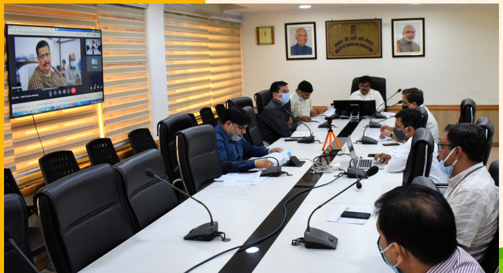
MoHUA officials at in ARHCs Review Meeting

A meeting was held to discuss with private real estate developers and other stakeholders on measures for fast-tracking the implementation of Affordable Rental Housing Complexes (ARHCs) & new strategy for slum redevelopment under Pradhan Mantri Awas Yojana- Urban (PMAY-U) Mission. In addition to this, the status of Live Laboratories at six sites under Light House Projects (LHPs) was also discussed. Meeting was attended by officials of MoHUA, States & UTs.